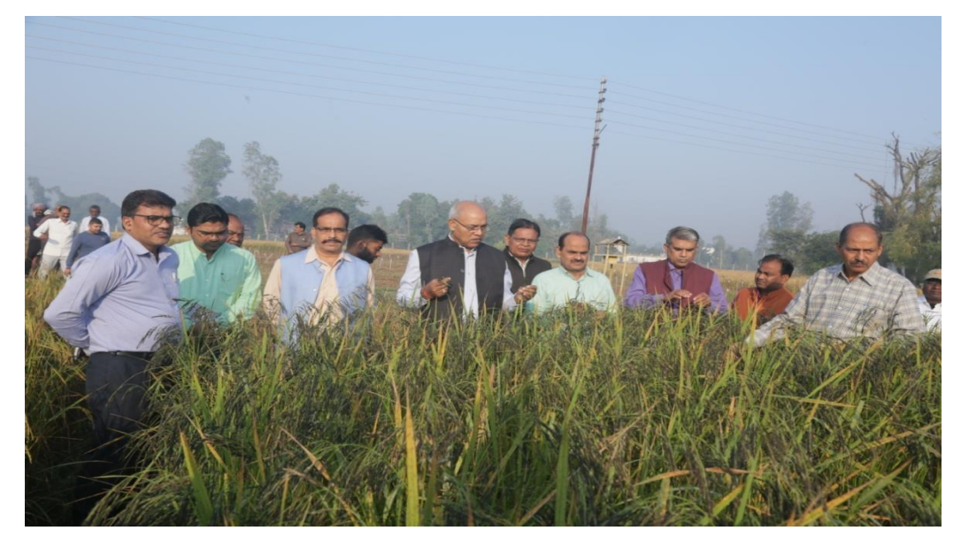
Monitoring of Kalanamak Experiment

Kalanamak CRD-2" which can be helpful for Indian government in achieving the target of rice exports of 400 million US Dollar. The university is also working to supplement the poor people diet by rice fortification with micronutrients like iron, zinc and pro-vitamin-A.