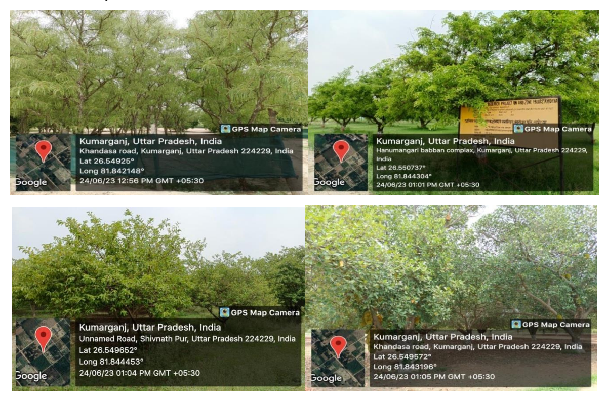
Orchards of Aonla, Bael, Ber and Jackfruit Grown on Reclamed Land

Eighty five percent Aonla cultivation area (nearly 98000 hectares) is covered by popular varieties (Narendra Aonla-4, 5, 6 and 7) developed by the university. Bael cultivation is dominated by Narendra Bael-5 and Narendra Bael-9 which cover more than 40% Bael cultivated area of our country.