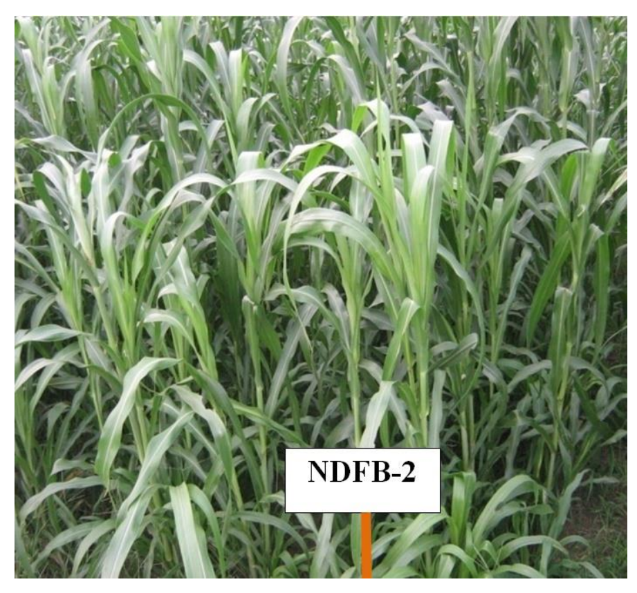
Bajra Variety (NDFB-2) Suitable for Salt Affected Areas