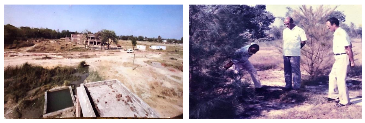
Wasteland before Establishment of the University

The university is distinguished for wasteland management under sodic and submerged conditions. Prior to establishing the university, vast area of sodic soil, had a pH, EC (ds/m), ESP, and Organic carbon percentage ranged from 10.4 to 10.6, 18.3 to 24.5, 76 to 84, and 0.08 to 0.16, respectively make agronomical practices impossible. The university has developed technologies to overcome the problems associated with salinity and submerged condition by continuous development of planting materials/varieties suitable for wasteland.