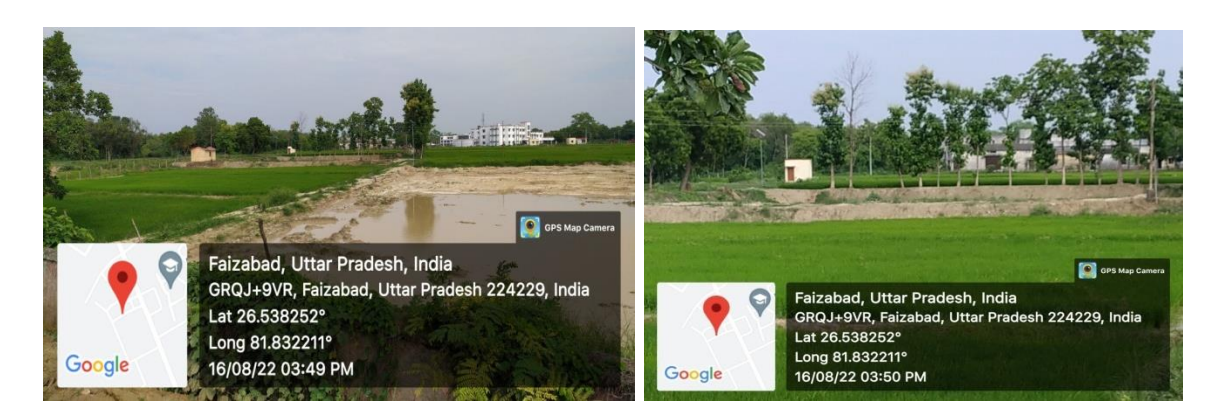
Technology Park Developed on Wasteland, Near Gate No.1 of the University

An area of 3.5 hectare has been reclaimed for establishment of Technology Park. Under this, a fish pond has been developed and the remaining land reclaimed for crop production.