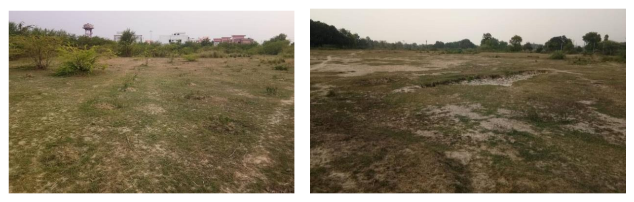
Wasteland of the University in 2019 before Reclamation