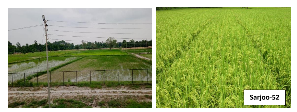
Rice Crop Grown in Reclaimed Wasteland