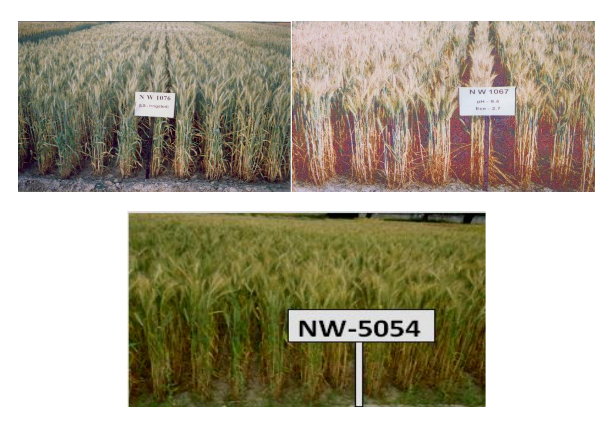
High Yielding Salt Tolerant Wheat Varieties (NW-1076, NW 1067 and NW-5054)