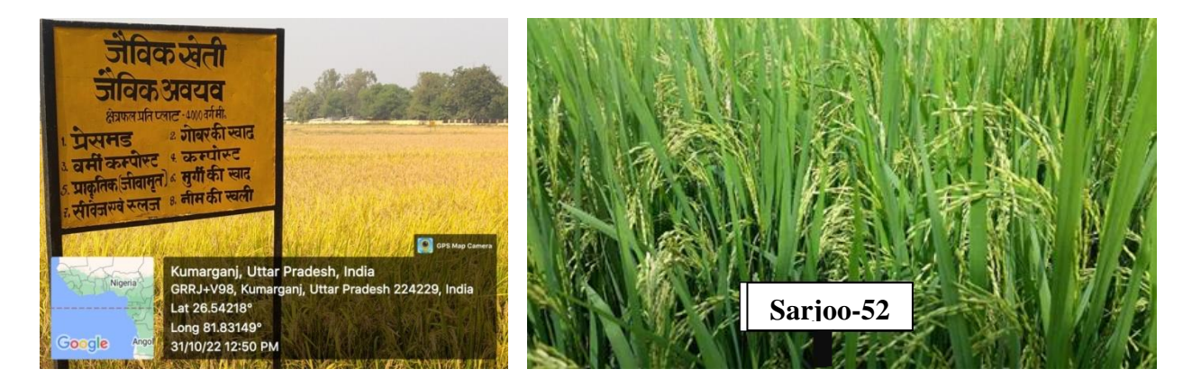
Natural and Organic Farming at the University Farm

The university has established a model of inorganic fertilizer and chemical-free "Natural/Organic" farming system. An agro-ecology based diversified farming system integrates crops, trees and livestock with functional biodiversity. It is backed by our rich traditional knowledge, and is a practice of agriculture based on locally available resources, which makes it a sustainable and viable practice.