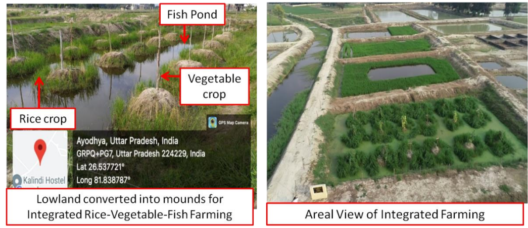
Integrated Rice-Vegetable-Fish Farming