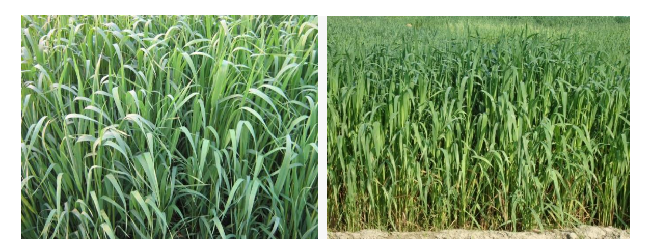
Oat Varieties (Narendra Jayee-1 and Narendra Jayee-2) Suitable for Salt Affected Areas