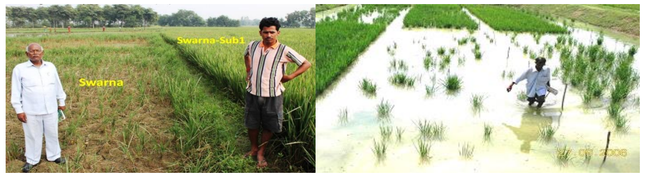
Submergence Rice Varietys (Swarna Sub-1)

The university is also working on improvement of Kalanamak for high yielding, short stature, and tolerance to biotic and abiotic stresses with strong aroma and nutritional quality with the help of state and nationally funded projects. Recently, the university has released two improved Kalanamak varieties, viz., "Pusa Narendra Kalanamak-1" and "Pusa Narendra