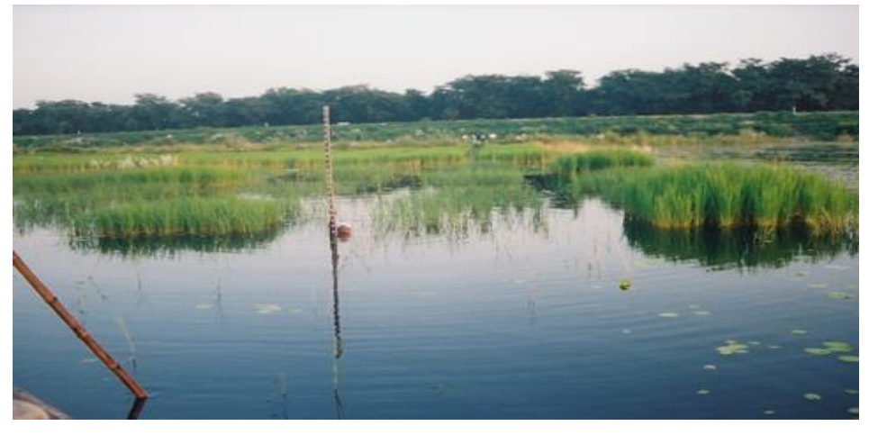
Performance of Rice Variety (Jal Lahari) in Deep Water