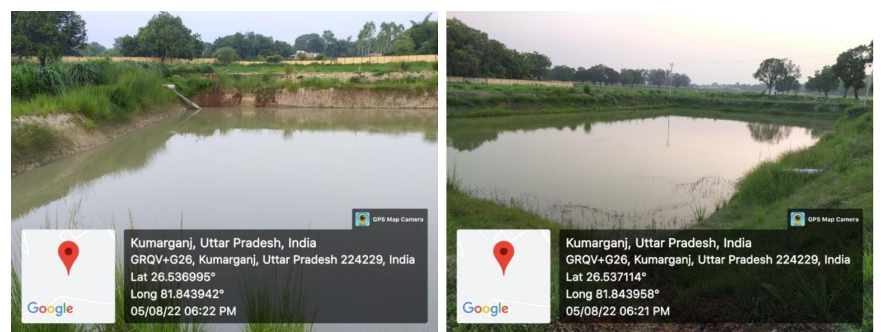
Fish Ponds Developed on Wasteland