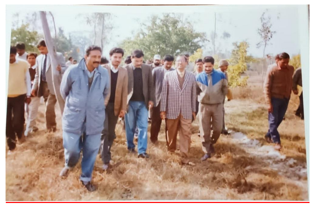
Visit of the Team of Uttar Pradesh Bhumi Sudhar Nigam at the University Campus during 27-29 January, 1995