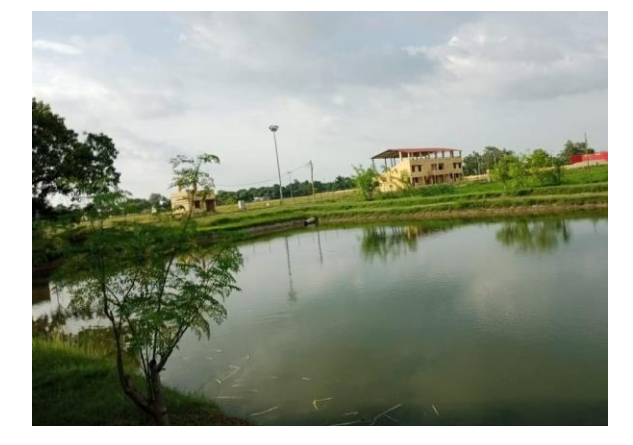
NSP-6 developed on wasteland