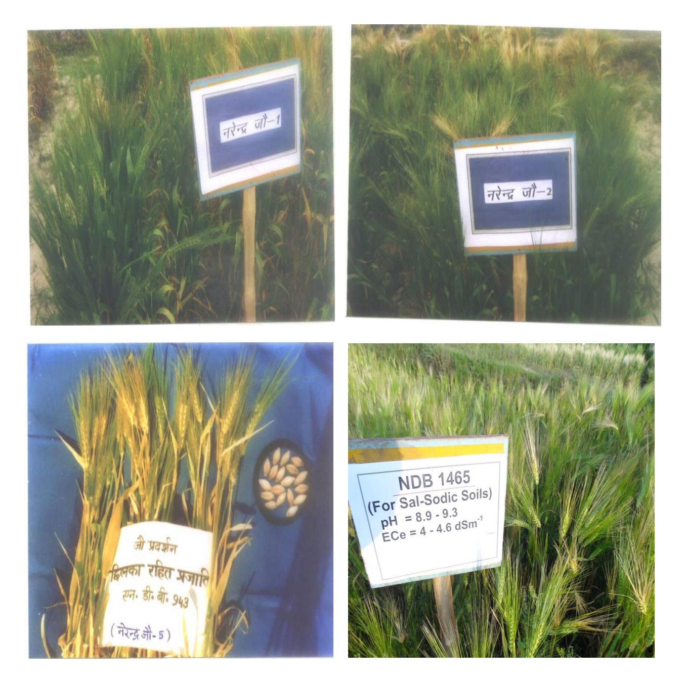
Barely Varieties (Narendra Barley-1, Narendra Barley -2, Narendra Barley-5, NDB-1465) Suitable for Salinity Conditions Developed by the University